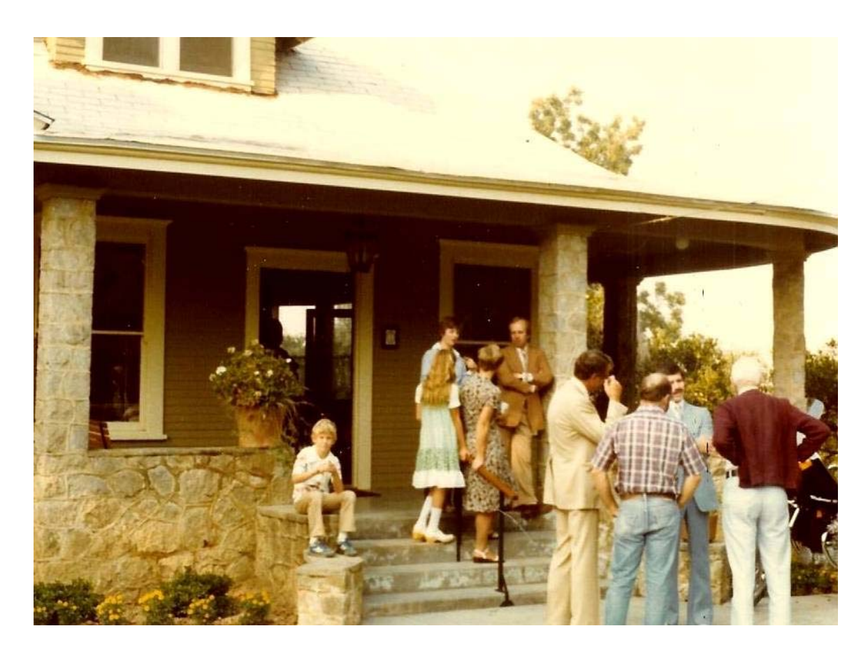
The "Church House" before the fire.

While we still did not have our own meeting place, this house at 1500 West Olive Avenue made a very serviceable place for offices and small group meetings. With some minor adaptations and redecorating, the place was ready for use by the ministers and staff. The acreage would provide the campus for our later buildings.